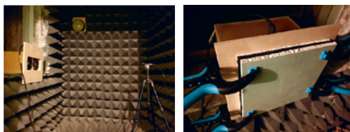
Semi anechoic chamber and insertion loss measurement stand.

Keywords – Baffle; devulcanization; insertion loss; rubber; sound reduction